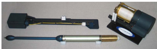
Figure 1. Probe/ Tail Spool, Re-winder & Winch

Line is spooled automatically off the probe's tail while it drops through the water, and line is manually paid out from the winch spool. The simultaneous payout of line from the probe's tail and winch effectively makes the line velocity zero through water, allowing freefall.