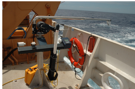
Figure 2. UCTD Assembled

The latitude and longitude of individual casts are obtained by matching an internal time stamp in the data file header to an externally collected GPS file. Synchronization of instrument and GPS time is important. MATLAB scripts were used for processing.